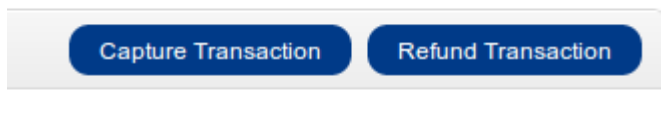
Figure 7.1: Capture or Cancel in OpenCart.

By clicking "Cancel Transaction", the transaction is cancelled and the reserved amount on your customer's card is released automatically.