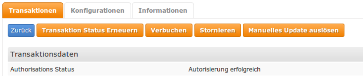
Figure 6.1: Cancelling of Orders in the JTL backend