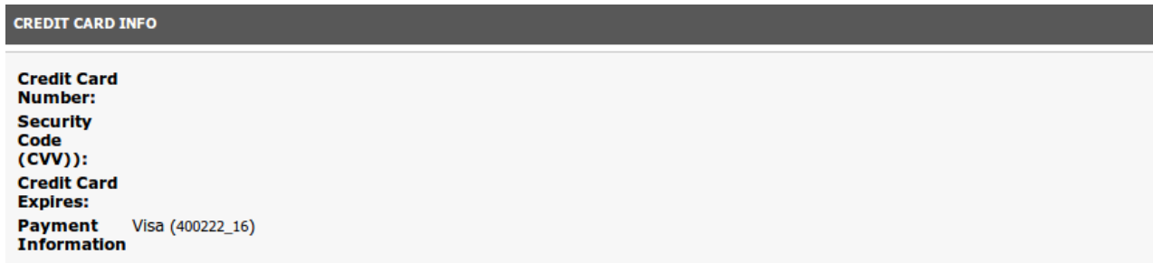
Figure 8.1: Transaction Information

Below you will find an overview of the most important features in the daily usage of the Sogenactif 2.0 module.