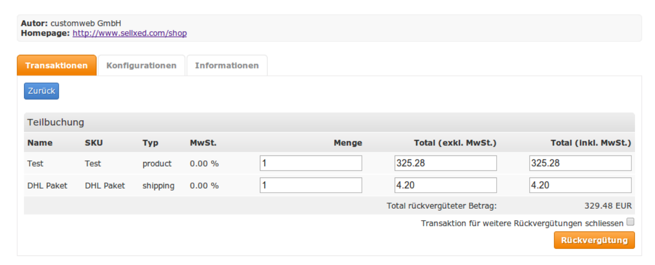
Figure 5.1: Refunds Directly from Within the JTL backend

You can also create refunds for already debited transactions and automatically transmit these to Trustly. In order to do so, open the invoice of the already debited order (as described above). By clicking on Refund a dialog box for refunds will open up. Insert the amount you wish to refund and then click on Refund . The transaction will now be transmitted to Trustly.