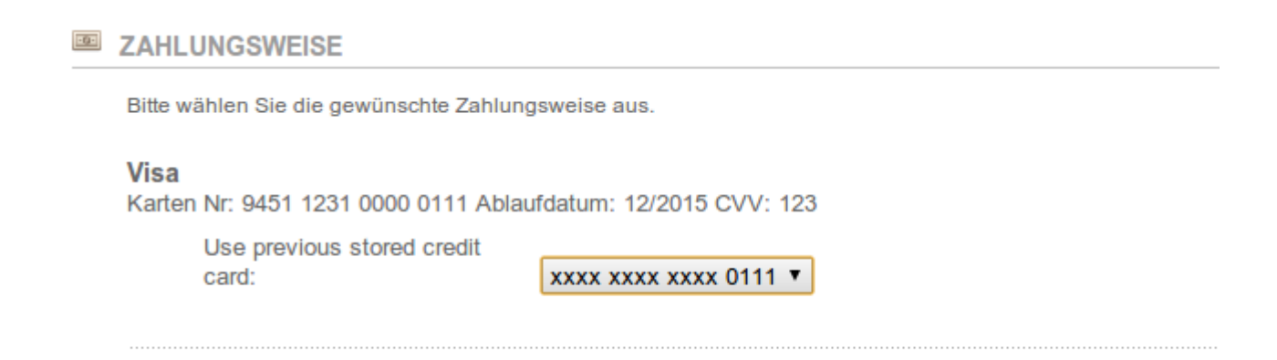
Figure 6.1: Alias Manager