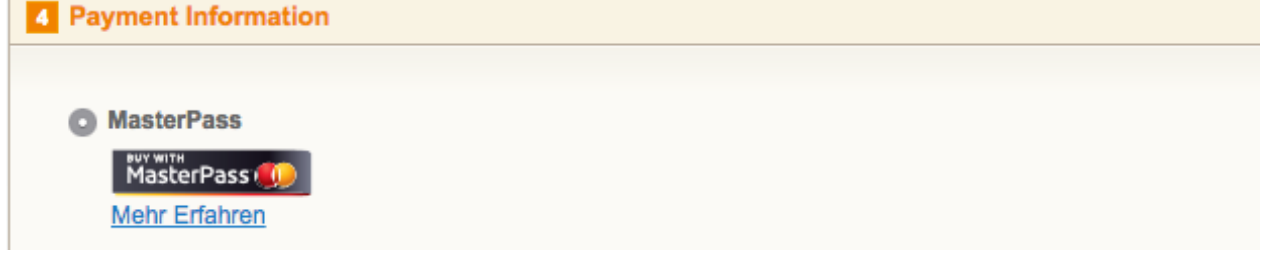
Figure 5.1: Example for entering a description (Magento). These settings are to be found in the payment method configuration for MasterPass.