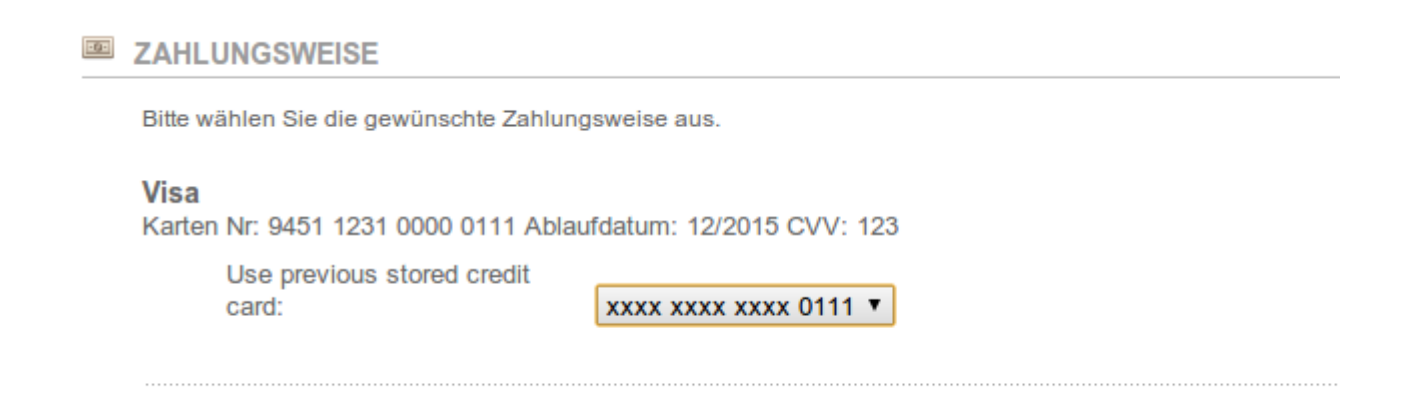
Figure 6.1: Alias Manager