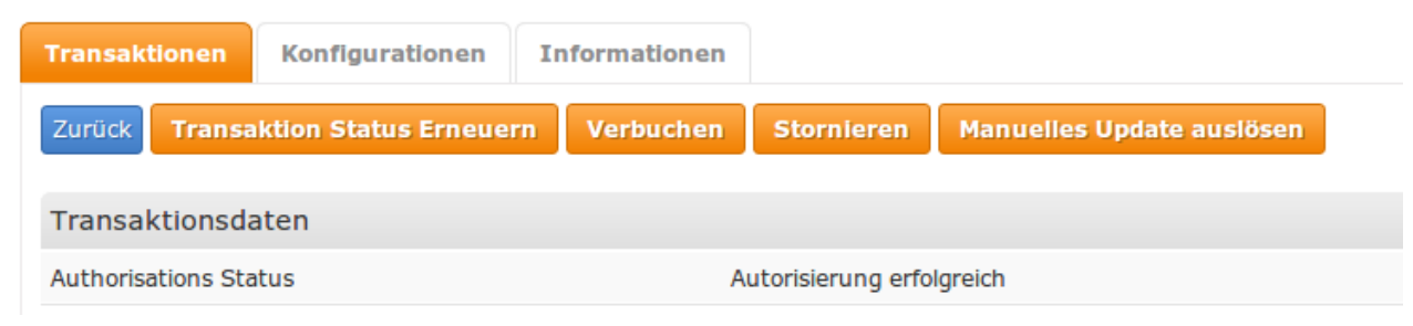
Figure 6.1: Cancelling of Orders in the JTL backend

In order to cancel an order, open the corresponding transaction. By clicking Cancel , a cancellation of the payment occurs with mPAY24. The reserved amount on the customer's card will be released automatically.