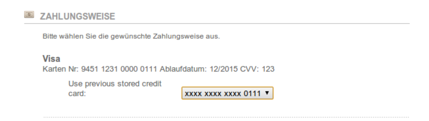
Figure 6.1: Alias Manager