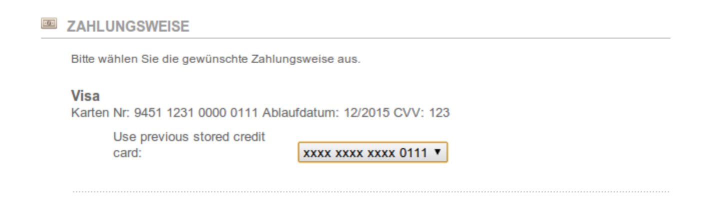
Figure 6.1: Alias Manager