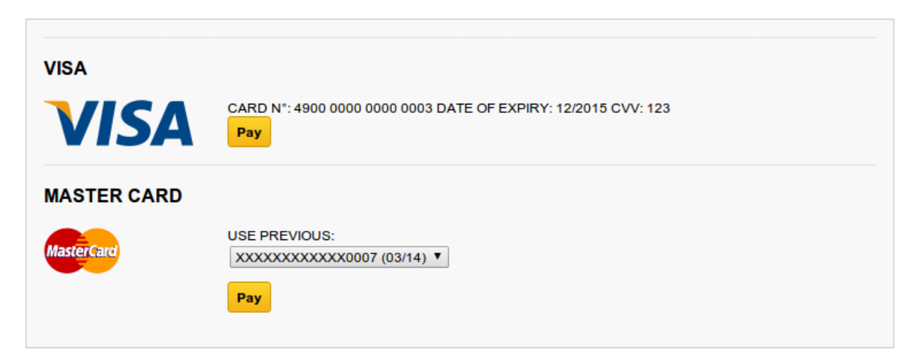
Figure 6.1: Alias Manager Usage Within PrestaShop.