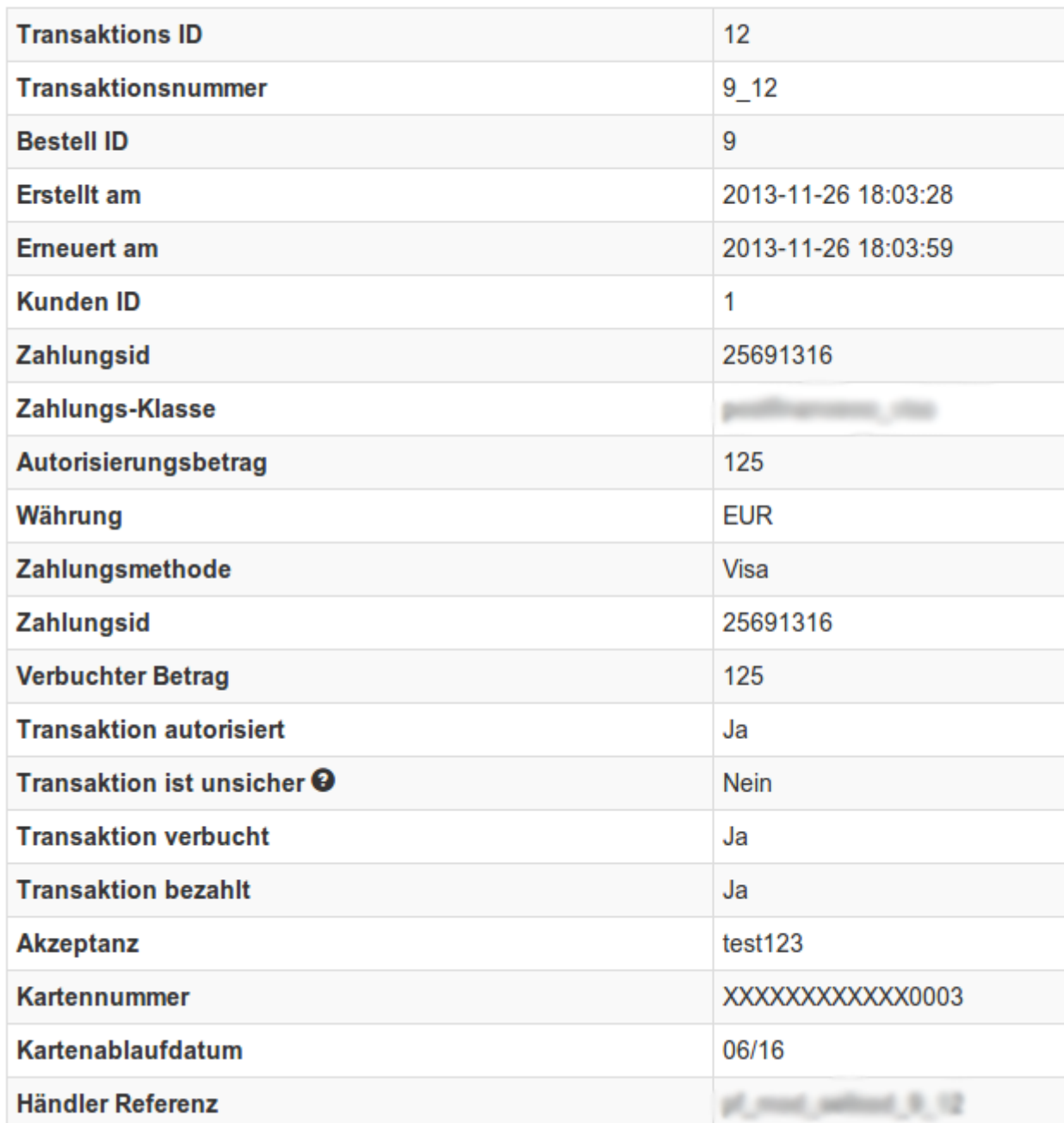
Figure 6.1: Transaction Information