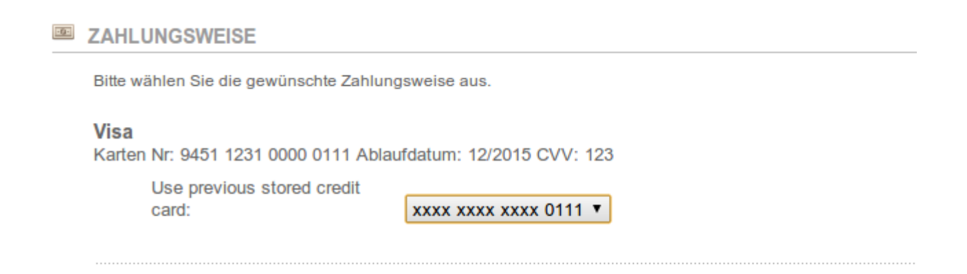
Figure 6.1: Alias Manager