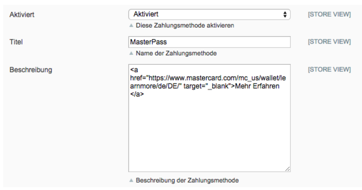
Figure 5.1: Example for entering a description (Magento). These settings are to be found in the payment method configuration for MasterPass.