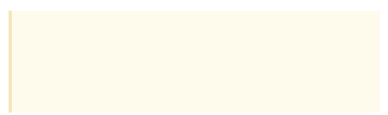
Figure 2.1: Configuration of the feedback URL for the HTTP-Feedback.