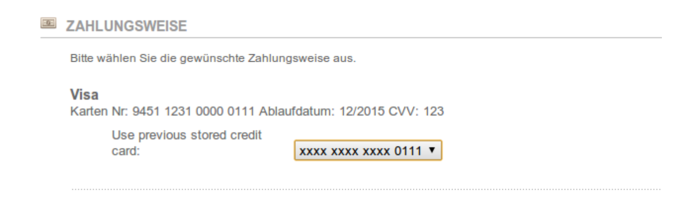
Figure 6.1: Alias Manager