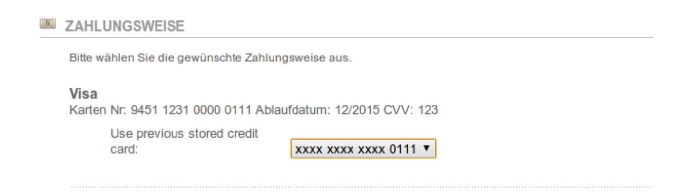
Figure 6.1: Alias Manager